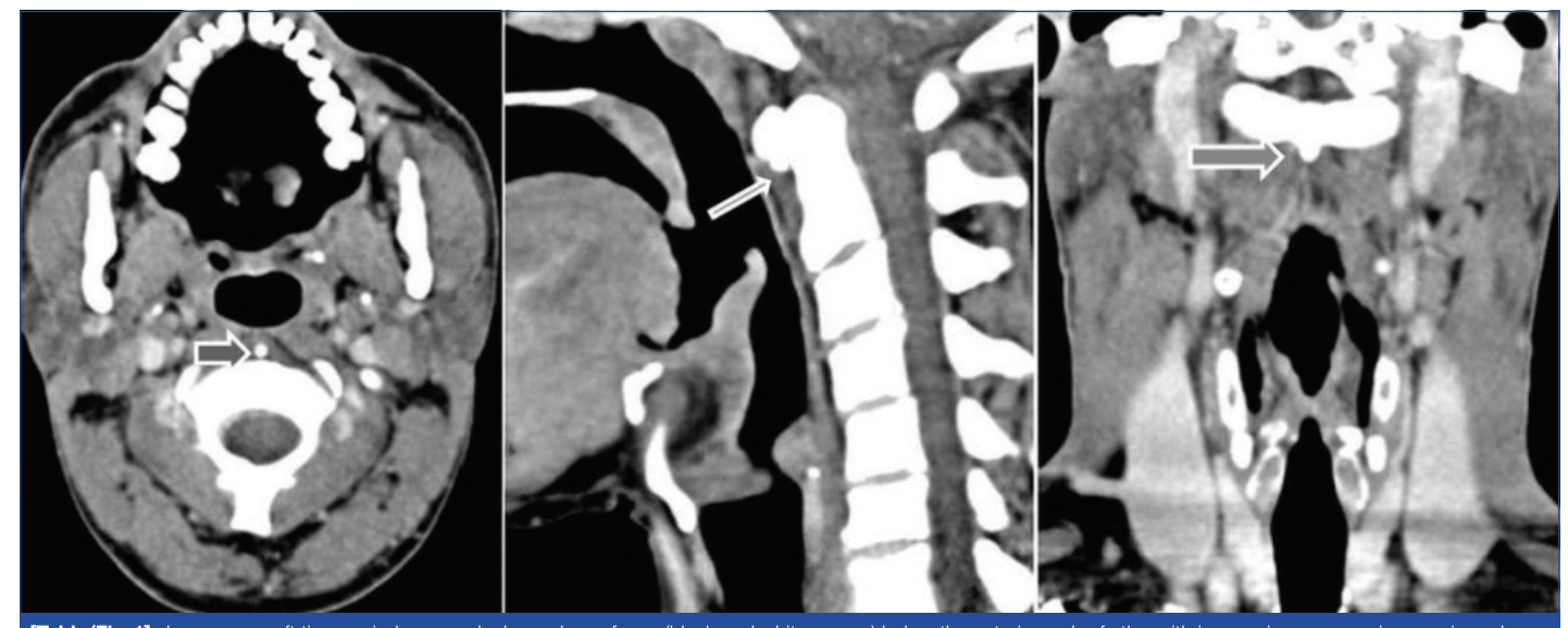
[Table/Fig-1]: Images on soft tissue window reveal a hyperdense focus (black and white arrows) below the anterior arch of atlas with inconspicuous superior margin and no prevertebral soft tissue swelling.

The first description about this skeletal variant can be traced down to "Borderlands of normal and early pathologic findings" by Kohler A et al., which was published in 1956 [1]. However, the first exact description of this entity in terms of its development, the probable site of origin, location, morphology, and nomenclature was given by Keats TE in 1967 [2]. Farman AG et al., described the anatomical variations involving atlas in terms of superior articular processes, arches, and ossicles, with three patients having accessory ossicles above the posterior arch of the atlas [3]. Wysocki J et al., described the variants of all cervical vertebrae with particular emphasis on the occurrence of accessory bony processes arising from the posterior arch, lateral masses, or transverse processes in a considerable number of cases [4]. The developmental basis of the atlas was mentioned in 1981 by Cone RO et al., [5]. It was reported that